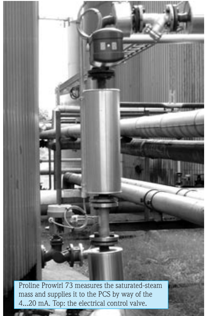
Proline Prowirl 73 measures the saturated-steam mass and supplies it to the PCS by way of the 4...20 mA. Top: the electrical control valve.